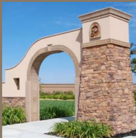
Positano Braddock & Logan Group