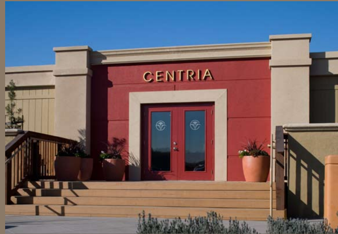
Centria, D.R. Horton MAME Award Best Sales Center D. R. Horton