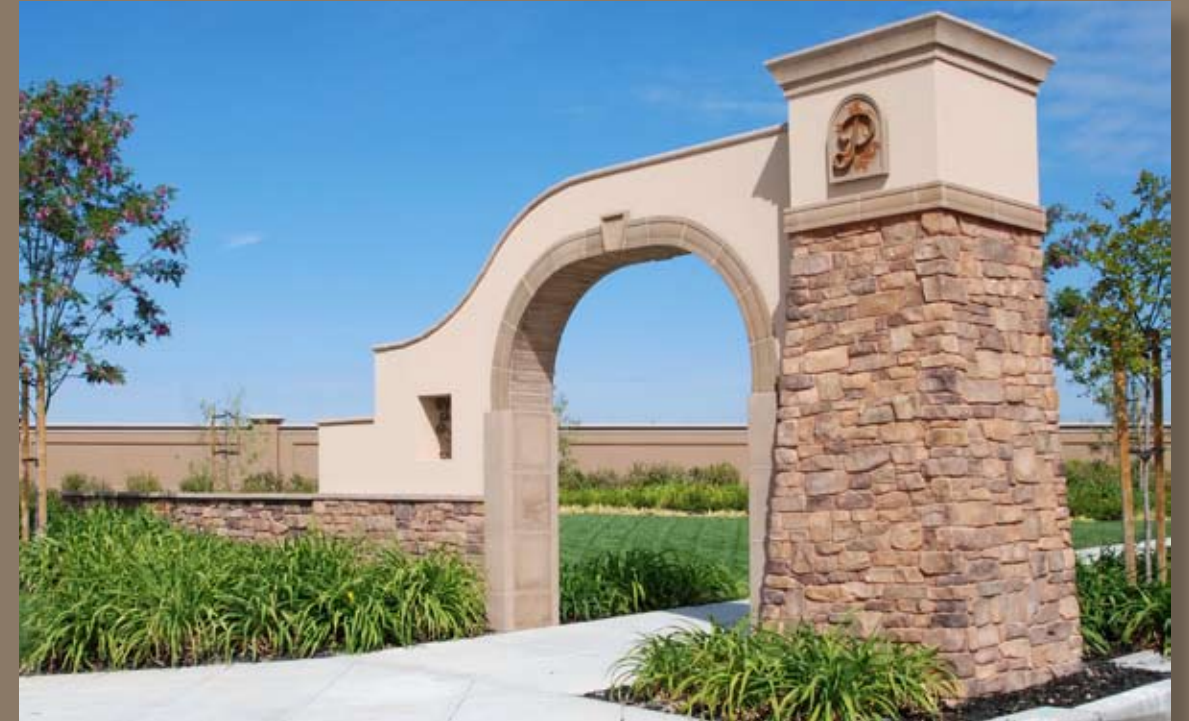
Positano Braddock & Logan Group