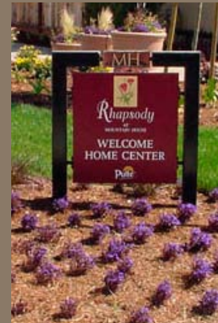
Mountain House Way-finding structure