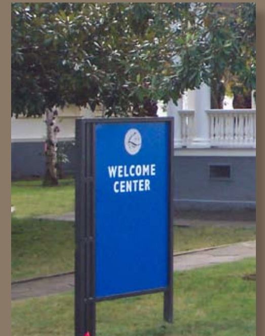
Mare Island Way-finding structure