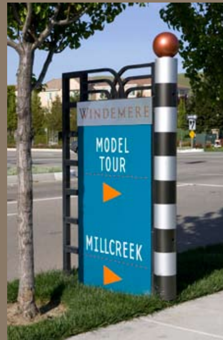
Windemere Way-finding structure