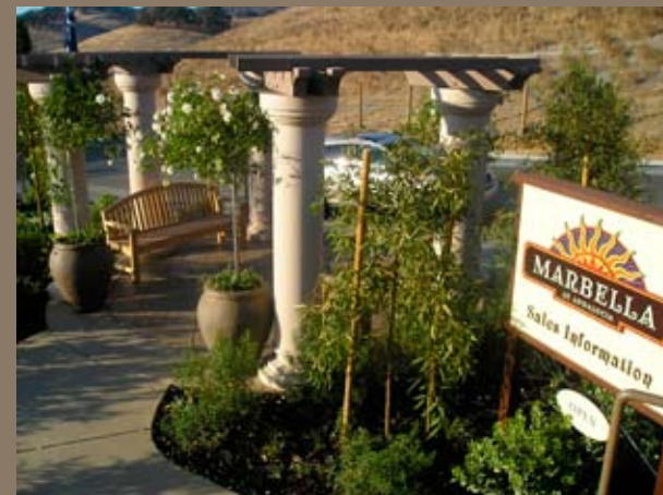
Sales information entry Standard Pacific

Élan, D.R. Horton MAME Award Finalist D. R. Horton